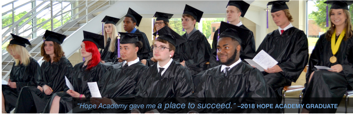
"Hope Academy gave me a place to succeed." -2018 HOPE ACADEMY GRADUATE

The mission of Hope Academy is to provide a safe, sober, and challenging academic experience for teens in recovery from substance use disorder.